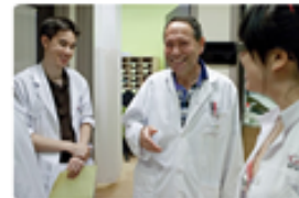
Clinician Educator Diploma (CE-d)

What's new... The Clinician Educator diploma committee members are being selected and are tentatively scheduled to meet in October 2012.