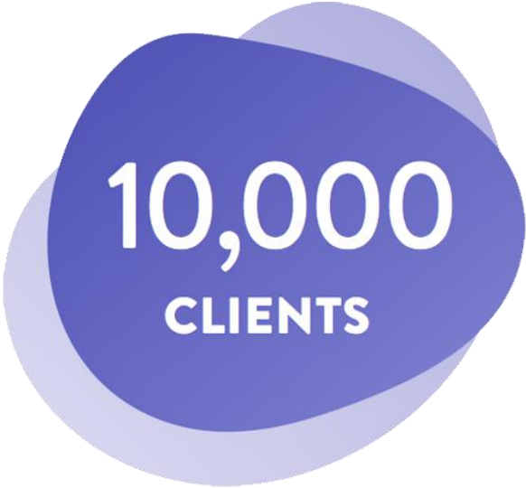
10, 000+ Clients served annually