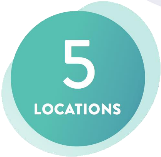
5 locations in Toronto