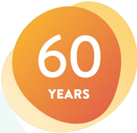
60 years in service