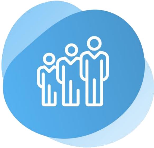
Support across the lifespan